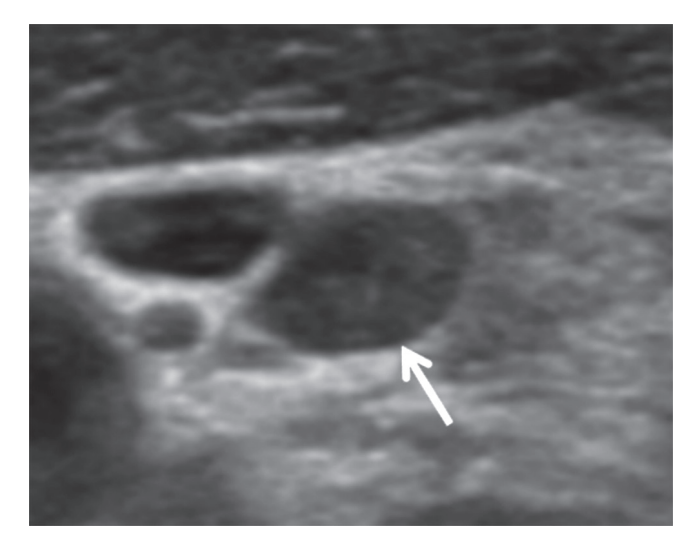
Fig. 1. Representative case of ultrasonographic indeterminate lymph node with final diagnosis of metastasis in 55-year-old woman with papillary thyroid carcinoma. Grayscale ultrasonographic image shows relatively round lymph node (short diameter: 3.6 mm; long diameter: 4.8 mm; L/S ratio: 1.3) (arrow) with no definite echogenic hilum or suspicious feature at left neck level IV. L/S = long-to-short diameter

Cohen's unweighted \kappa coefficient for US classification of LNs was 0.812 (95% CI: 0.757–0.866), indicating almost perfect agreement.