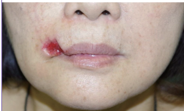
Fig. 2. Intraoperative findings

A 68-year-old woman was bitten by a dog, causing a defect of the right upper lip involving the white lip and the dry red lip. The defect measured 20 mm horizontally and 15 mm vertically. The wound was washed under local anesthesia, and an artificial dermis with a silicone sheet was sewn into place.