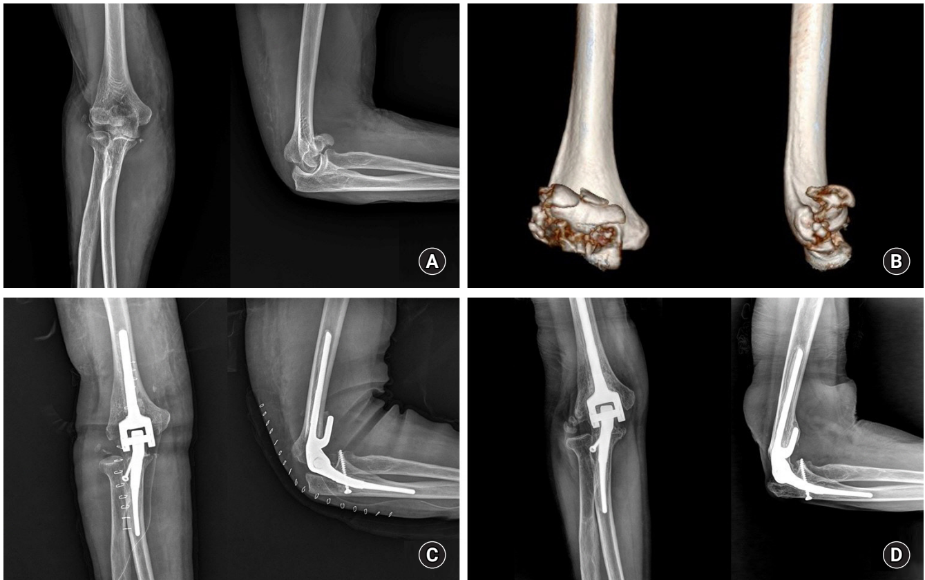
Fig. 1. (A, B) Initial radiographs and three-dimensional computed tomography images of a 73-year-old woman show an intercondylar comminuted fracture of the right distal humerus. (C) Immediate radiographs after total elbow replacement. (D) Radiographs at 48 months after surgery show no evidence of loosening with excellent clinical outcome.

term functional result in older low-demand patients with osteoporosis [4]. However, TER may accompany considerable postoperative complications such as infection, implant loosening, neurological problems, and periprosthetic fracture.