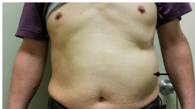
Fig. 1. Photograph of the left rectus abdominis muscle atrophy. The left lateral abdominal wall bulging is present (arrow).

A 52-year-old man was referred to our hospital with acute mediastinitis, empyema, and thoracotomy incision site infection. The patient underwent surgical treatment for esophageal rupture at another hospital, 9 days prior to presentation. On admission, the patient was in a state of septic shock; therefore, we performed