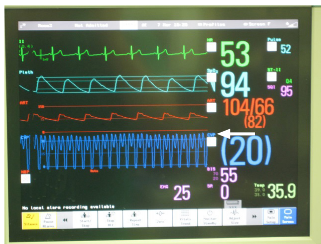
Fig. 4. Intraoperative monitored vital sign denoted as 'central venous pressure' (arrow) shows pressure of injected fluid to the right lung.

There is no consensus regarding the total volume of infusion in WLL, and it varied significantly 5–40 liters of saline [16]. Most institutions repeat the infusion and drainage until the effluent is relatively clear by visual inspection. In a previous case of using a