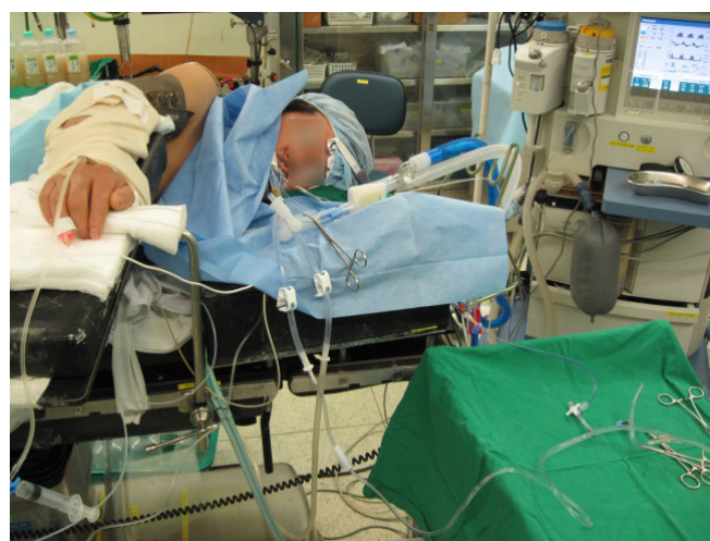
Fig. 3. Left lateral decubitus position (lavage side up) and application of a Y-connector attached to the double lumen endotracheal tube.

PAP was first described by Rosen et al. [6] in 1958, since the accumulation of lipoproteinaceous material in the alveoli lead to nonspecific symptoms such as cough, hypoxemia, and dyspnea. Histopathologic examination reveals that presence of lipoproteinaceous material in the alveoli. Radiographic appearance of PAP are extensive bilateral infiltration on chest radiograph and ground-glass opacifications which is commonly referred to as crazy paving on computed tomography images. However, there is often a dissociation between the extent of radiographic abnormalities and severity of the symptoms and physical findings [1], and variable/nonspecific clinical symptoms delay PAP diagnosis [7]. PAP has been classified into three types according to the developmental