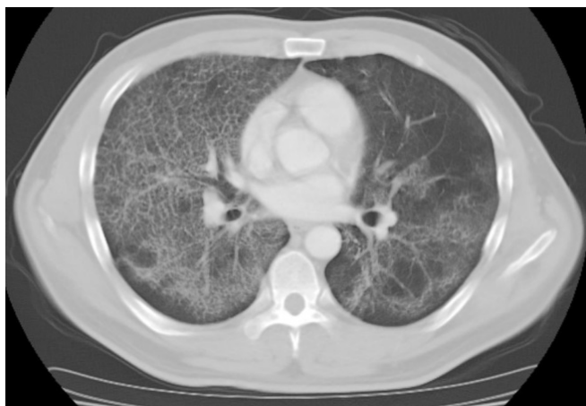
Fig. 1. Pre-whole lung lavage HRCT findings. HRCT scan shows ground glass opacities and crazy paving pattern. HRCT, high-resolution computed tomography.

We administered oxygen (6 L/min) via a nasal cannula. The patient had entered the operation room while appearing to be mentally alert and subsequently, electrodes from an electrocardiogram, pulse oximeter, noninvasive blood pressure (BP) monitor, and bispectral index (BIS) monitor were attached to the patient. The radial artery catheter was placed under local anesthesia to