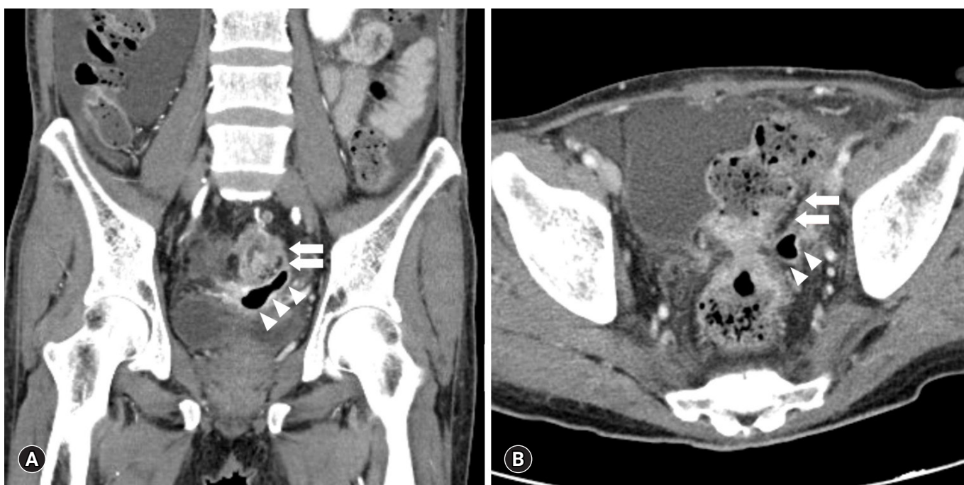
Fig. 3. The abdominal computed tomography (A, coronal view; B, planar view) shows segmental wall thickening (arrows) of the rectosigmoid junction with adjacent free air (arrowheads).

There are several mechanisms by which purulent pericarditis can develop: a direct spread of a thoracic infectious focus [4], hematogenous spread [5], and very rarely as an extension from a