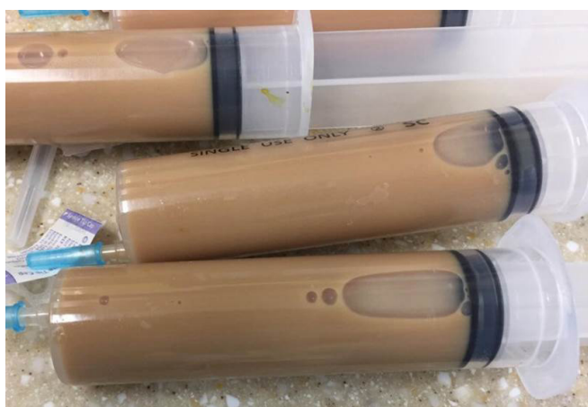
Fig. 2. Pericardial pus with a turbid yellowish brown color, which was drained via pericardiocentesis.

His clinical symptoms and laboratory findings gradually improved with continuous renal replacement therapy, and IV meropenem was continued for 3 weeks. A contrast abdominal CT scan, performed on the 9th hospital day, showed a segmental wall thickening of the rectosigmoid junction with adjacent free air, which was suspected of being a rectal malignancy with a microperfora-