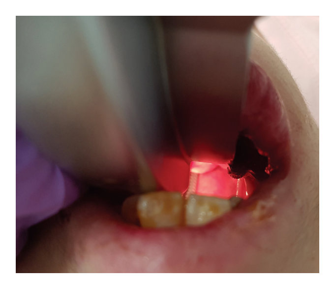
Fig. 1. Laryngoscopic field of view (in the stable condition) after successful intubation using a size 3 Macintosh curved blade. The Cormack-Lehane Grade was 4 before intubation, but intubation could not be delayed to take a photograph.

The ETT was placed at a depth of 23 cm from the