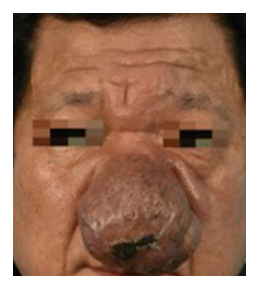
Fig. 1. Preoperative clinical photograph. A male patient presented with a nasal mass of 8×5 cm.