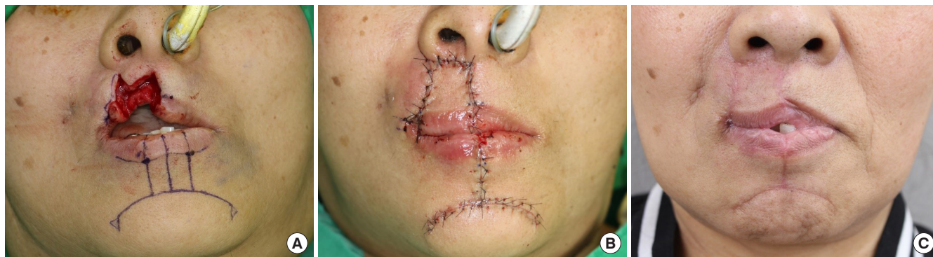
Fig. 3. To correct the drooling and lip seal due to the resultant upper lip defect and scar contracture, scar release and Abbe flap coverage were planned. (A) Six months later, Abbe flap surgery was performed for delayed reconstruction of the upper lip. (B) Immediate postoperative view. (C) Three-month follow-up view.

nodule in the right upper lobe, which may have resulted from septic emboli originating from the upper lip infection (Fig. 1C). The Laboratory Risk Indicator for Necrotizing Fasciitis score was 10 points, placing the patient in the high-risk category; this measure considers C-reactive protein level, white blood cell count, serum hemoglobin, glucose, sodium, and creatinine level. Due to an impression of septic shock as a result of the upper lip NF, immediate surgical intervention was planned. Debridement under general anesthesia confirmed full-layer necrosis of the upper lip including the orbicularis oris muscle (Fig. 2A).