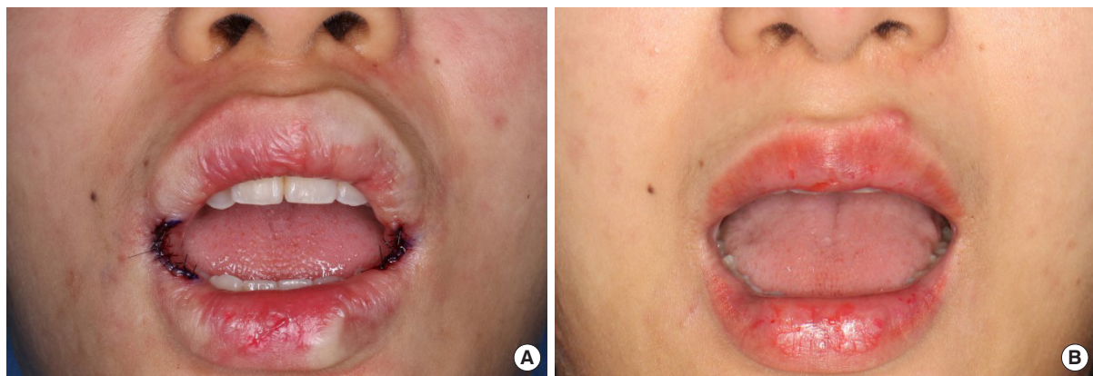
Fig. 3. Postoperative photographs. (A) Immediate postoperative view. (B) After 12 months, the intercommissural distance was 41 mm and mouth opening was 35 mm.