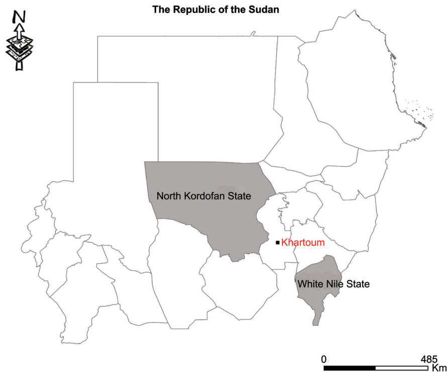
Fig. 1. Map showing study areas. Black dot, region where sheep were slaughtered. Grey region, sheep origin.

Thirty cyst samples (2-5 cm in size) from liver were harvested from slaughtered sheep in various homes in the Western Nile (Al-Hajyosif and Al Gouz)- Khartoum, Sudan, during a meat/slaughtering inspection for the Addha festival (September 2017). A total of 1,500 sheep were examined during the inspection. However, the slaughtered sheep were said to have originated from North Kordofan State and the west White Nile State of Sudan (Fig. 1). DNA was extracted from a portion of each cysticercus using the phenol-chloroform extraction method. Extracted genomic DNA samples were stored at -20^{\circ}\text{C} until use. PCR amplification of the mitochondrial nad1 and cox1 genes was performed using the following primer pairs specific for cestode parasites: forward 5'-CARTTTCGTAAGGGBCC-WAAWAAGGT and reverse 5'-CCAATTCYTGAAGTAAACAG-CATCA [19]; and a newly designed forward (5'-AGTCCTGAT-GCTTTGGGTTCTATGGA-3') and a previously reported reverse primer (5'-AAGCATGATGCAAAAGGCAAATAAAC-3') [20], for the nad1 and cox1 genes, respectively, with expected fragment sizes of 871 and 939 bp, respectively. PCR was conducted in a 25 \mu\text{l} reaction mixture containing 12.5 \mu\text{l} Premix Ex Taq TM version 2.0 (Takara Bio, Japan), 10 pmol of each primer, 0.5 \mu\text{l} of genomic DNA extract (20-200 ng), and