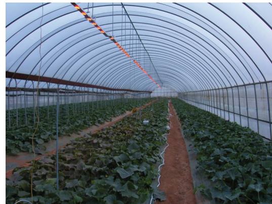
Fig. 2. Scene of alternative red and far-red light treatment (left) and far-red light treatment on growing oriental melon (light).

after treatment with far red light, increased from the treatment with red light. In addition, the tillers, leaf length, and fresh weights of stems and roots of wheat showed photoreversibility due to the red and far red lights. In this study, the experimental subject, oriental melons, were dicotyledons, while the subject in the experiment of [13] was wheat, which was monocotyledon. The emerging patterns between the tillers of monocotyledon and axillary stems of the oriental melon, which is a dicotyledon, were also different. Kasperbauer [8,14] reported that the short red light irradiated on the beans for a few minutes at the end-of-day resulted in the relatively large and thick leaves, short stems, and large fresh weight of the roots. On the contrary, the far red light treatment on the beans for a short time at the end-of-day showed thin leaves, high plant height, heavy stems, and relatively small roots. In addition, Kasperbauer [8] reported that the increased dry weights of the leaves and petioles of beans after treatment with the far red light were reduced by the red light treatment. Furthermore, the reduced dry weights of roots and