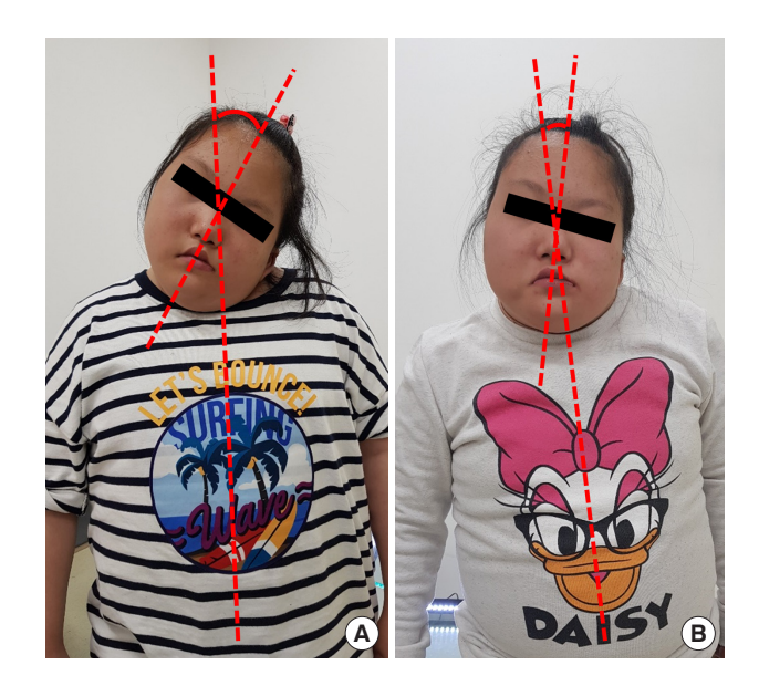
Fig. 1. (A) The angle of inclination of the head on the coronal plane is approximately 25 degrees before treatment. (B) The angle of inclination has improved to 10 degrees after 1 year of treatment. In both pictures, long vertical lines are at the midline of her body, and the short ones are at the midline of her head.

During her first visit in our outpatient department, she presented with the head rotated and tilted to the left, approximately 25 degrees (Fig. 1A), and prominent Adam's sign was observed on the left posterior upper back. The patient reported