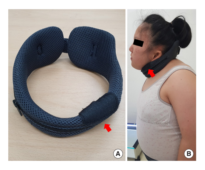
Fig. 3. (A) A customized soft neck collar. The Velcro is attached to the site of contact with the mandibular angle at the tilted head side (arrow). The neck collar is adjustable in height. (B) Because of the discomfort caused by the Velcro, the patient tilted her neck to the contralesional side.

cosmetic problems and neck pain due to the abnormal head posture. Plain film radiography and three-dimensional computed tomography (3D CT) scans to obtain an accurate assessment of her spine according to her current age were performed. Her cervicothoracic X-ray revealed left thoracic scoliosis at the T4 vertebral body with 50 degrees of Cobb's angle and right cervical scoliosis due to vertebral malformation (Fig. 2A), and 3D CT scan revealed right lateral C3 hemivertebrae accompanied with multisegmental fusion of the cervical spinal vertebral bodies, C4 to C6, which implied the possibility of KFS (Fig. 2B). Together with her pediatricians, we decided to perform whole exome sequencing to establish the diagnosis, but genetic evidence of KFS was not found.