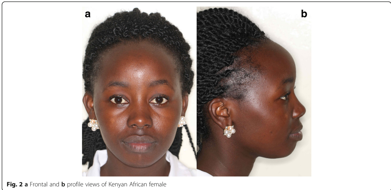
Fig. 2 a Frontal and b profile views of Kenyan African female

the South Indian population, in general, had a wider lower face while NAW showed wider midface and overall greater values of proportional indices than North American Caucasian population [6, 7]. A Turkish population study clearly shows anthropometric variation for fronto-occipital, circumference, intercanthal distance, outer canthal distance, near and distant interpupillary distance, canthal index, and circumference-interorbital index with age [9].