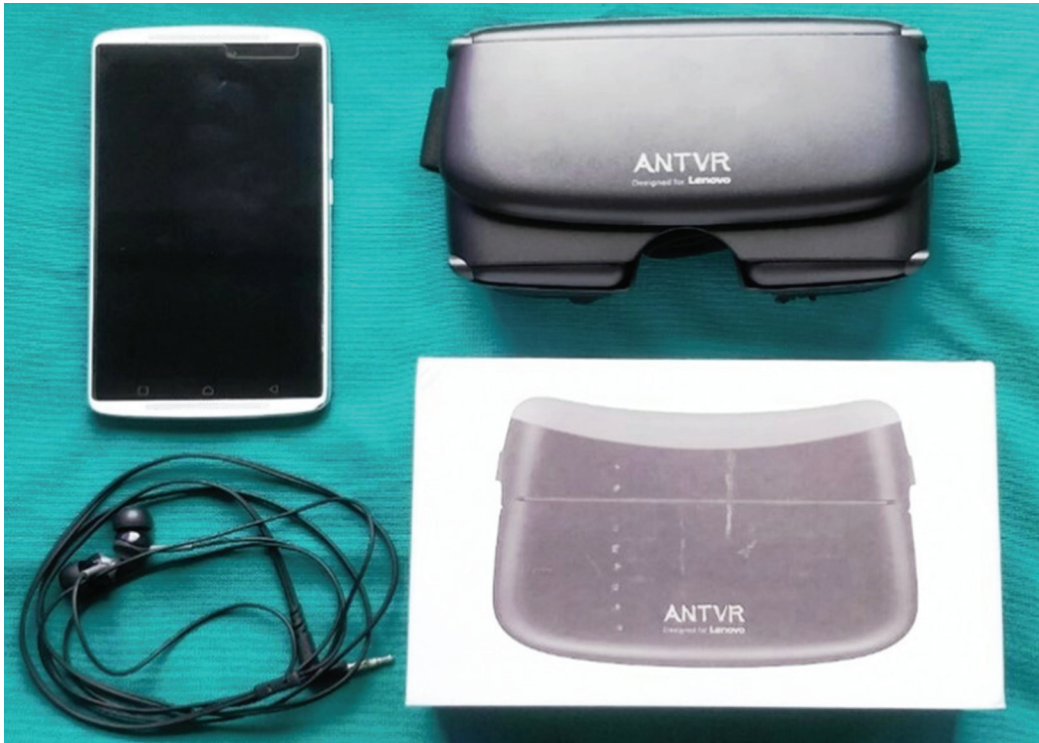
Fig. 2. Materials used for virtual reality distraction (Lenovo smartphone, Sennheiser earphones, and ANTVR glasses).

excluded from participation. Signed informed consent was obtained from the parent or legal guardian of the included children.