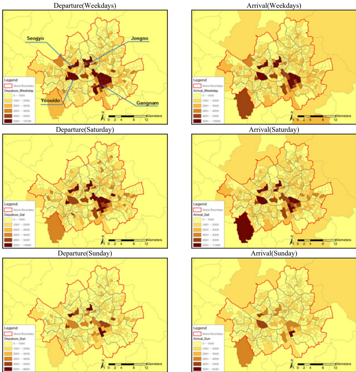
<Fig. 2> Spatial distribution of departure/arrival trips