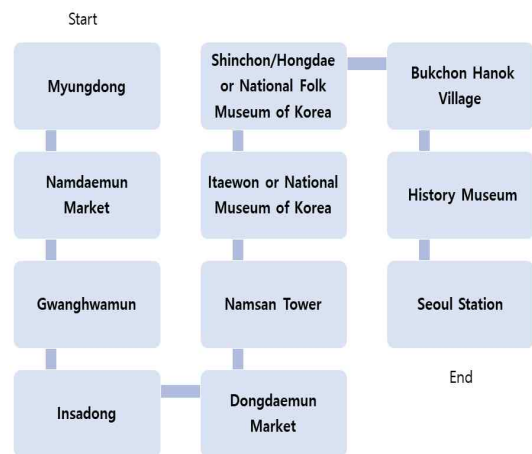
Fig. 5. Recommendation of optimal route for foreign visitors

Given the interest in something original to Korean as the crawling results showed, the subway and bus were selected as the more accessible transports than cars. Given foreigners moved to Seoul Station from the airport, and considering the highest Lift as found in the association analysis, Myungdong was chosen as the start point.