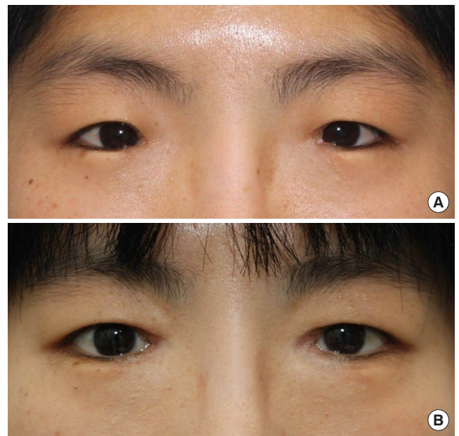
Fig. 3. (A) Preoperative view. (B) Postoperative view at 9 months.