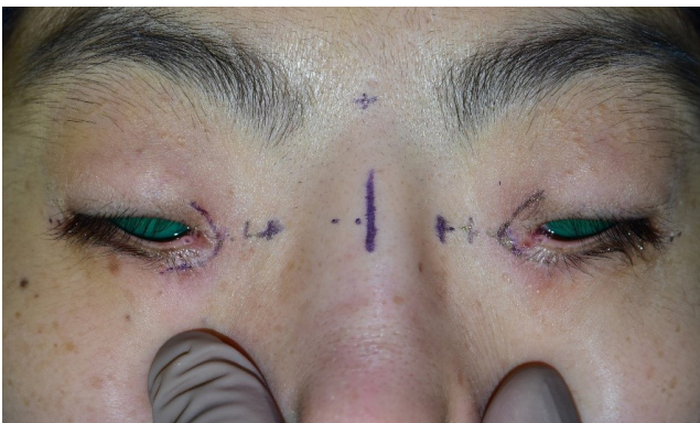
Fig. 1. Preoperative design for Y-shaped epicanthoplasty incision.

Numerous surgical procedures have been attempted to treat telecanthus, without a consensus on the optimal technique. The reason may be because telecanthus correction has been a challenge as it is often difficult to fix the MCT to the proper point of the orbit, resulting in incomplete correction and recurrence due to loosening of the tendon. Among the available techniques, oblique transnasal wiring is easily performed and has few complications [6]. Traditionally, coronal incisions and open sky techniques have been used for fixation of the MCT, because these methods can provide a good operative field. However,