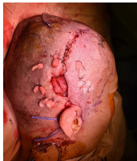
Fig. 3. Fixation of the temporoparietal fascia flap to the scalp around the defect.