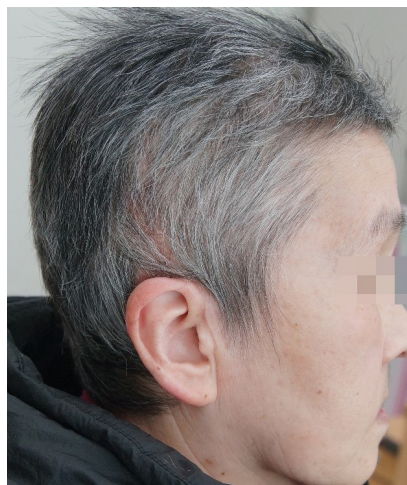
Fig. 5. Photograph at 5 months postoperatively.

The elasticity of the scalp is limited due to the underlying galea and pericranium. In general, primary closure can be an option for small and flat defects (< 2 cm 2 ), while a local flap is required for defects measuring 2–25 cm 2 [8]. Reconstruction could be conducted using a free flap if the flap condition is poor or if the defect is too large [9]. For severe defects that develop