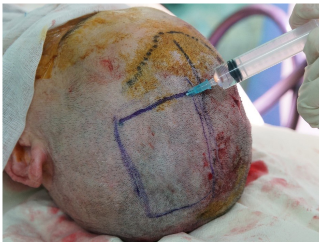
Fig. 4. Skin harvesting after infiltration of saline with diluted epinephrine.

tive day 7. Engrafting was successful without any graft loss. During a 5-month follow-up period, the wound healed without any complications (Fig. 5).