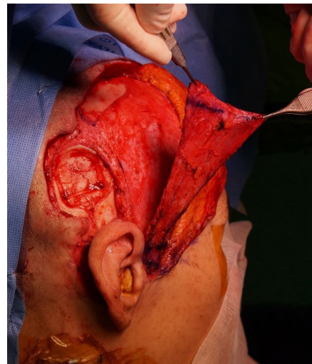
Fig. 2. Elevated flap.

The donor site region of the scalp was epithelized on postoperative day 6. The tie-over dressing was opened on postopera-