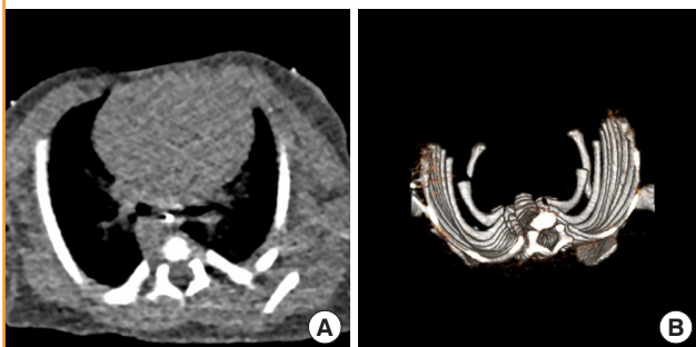
Fig. 2. Thoracic CT 9 months after sternal reconstruction

(A) Computed tomography (CT) and (B) 3-dimensional reconstruction of patient's thoracic cage at age 3 days, before sternal reconstruction. Note absence of sternum and open shape of thoracic cage, with left and right ribs in parallel, rather than curved.