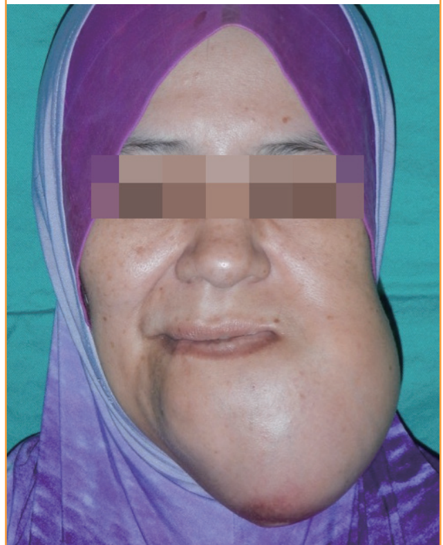
Fig. 1. A case of mandibular ameloblastoma

Mandibular resection was performed in several ways; when possible, segmental mandibulectomy with a surgical margin of 2 cm from the radiographic border of the tumor was performed, while in large tumors located around the ramus, hemimandibulectomy was performed. Immediate mandibular reconstruction with a free fibula osteocutaneous flap was performed following resection (Fig. 1). The maximum possible length of fibula bone