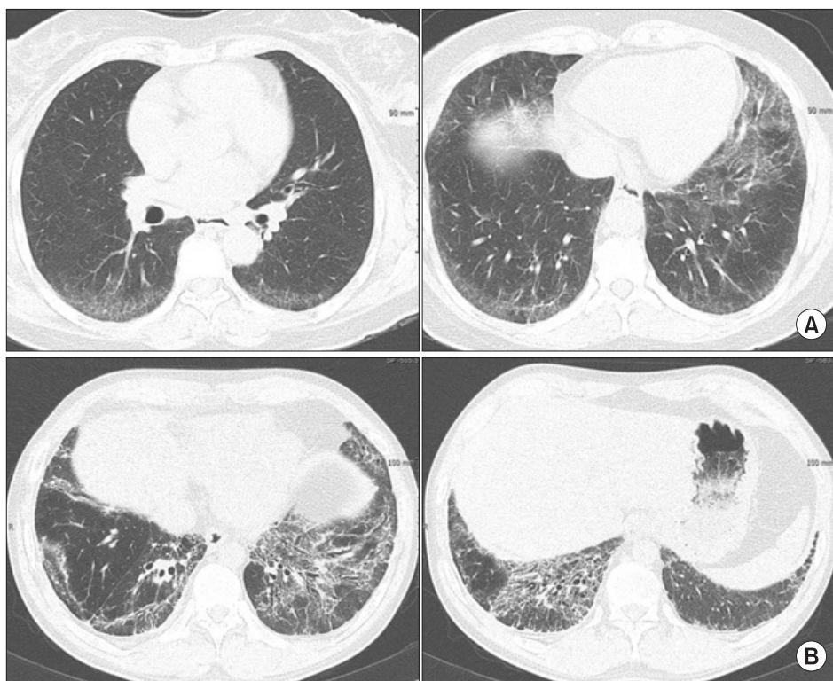
Figure 1. High-resolution computed tomography (HRCT) of nonspecific interstitial pneumonia. (A) HRCT axial images (lung window setting) show ill-defined ground glass opacities in periphery of the both lower lobes. (B) HRCT axial images (lung window setting) at level of both lower lobes demonstrate reticulation, ill-defined ground glass opacities, and traction bronchiectasis along bronchovascular bundles or along subpleural lungs.

Although T lymphocyte fractions increase (>20%) in the bronchoalveolar lavage (BAL) fluid of most patients, it is non-specific finding and only plays an auxiliary role for differential diagnosis. For example, increase of T lymphocyte fractions in