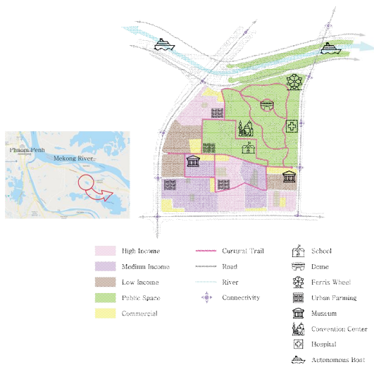
Fig. 2. Pilot site planning