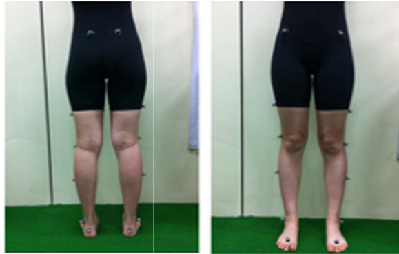
Fig. 1. Maker's attachment point