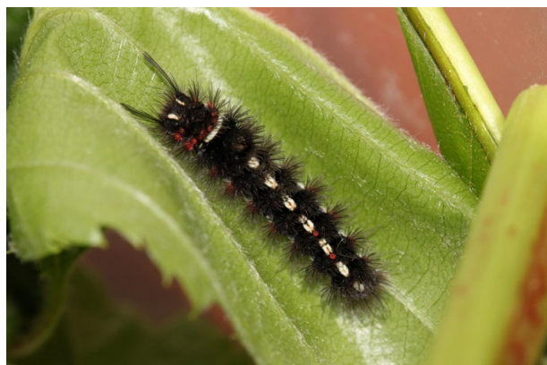
Fig. 3. Last instar of Euproctis fulvatus sp. nov.

female; frons broad and yellowish; labial palpi porrect, short and approximately equal to the eye diameter. Forewing dark yellowish; central fascia ochreous, slender, bar-shaped, medially curved. Hindwing yellowish white and termen dark yellowish. Abdomen dark yellow. Male genitalia (Fig. 2D, E): Uncus bifid, digitate, apically with a short triangular process; saccus V-shaped; valva simple, square, distally strongly invaginated; aedeagus stout, anterior broad; one long sclerotized cornutus present. Female genitalia (Fig. 2C) Papillae anales broad; ductus dorsae long, medially twisted, posteriorly strongly sclerotized with simple antrum; corpus bursae ovate without signum. Larvae (Fig. 3). Distinguished by a black head with a pair of long, black, lateral tufts, dorsum with 10–11 white intersegmental dots and bright red setal warts on T2–A8, and bright red glands on A6 and A7. Larva to 3 cm.