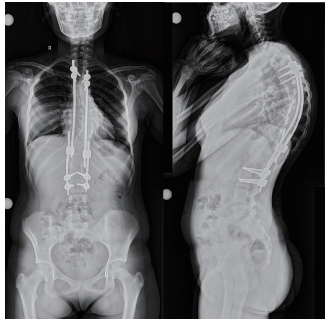
Fig. 4. Last follow-up AP/lateral X-ray of patient treated with TGR technique. AP : anteroposterior, TGR : traditional growing rod.

No correlation was observed between TK, PJA, and DJA in the postoperative period and last postoperative visit in both patient groups. Correlation was not detected between postoperative LL and DJA in both patients groups. In patients who underwent MCGR, the number of lengthening was positively correlated with postoperative PJA and negatively correlated with postoperative DJA ( r=0.674, p=0.016 ; r=-0.766, p=0.004 , respectively). There was a negative correlation detected between PJA and DJA in the postoperative period in patients who underwent MCGR ( r=-0.687, p=0.014 ).