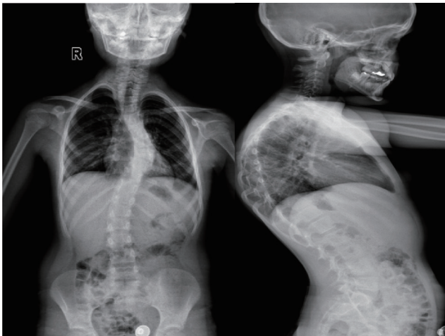
Fig. 3. Preoperative AP/lateral X-ray of patient treated with TGR technique. AP : anteroposterior, TGR : traditional growing rod.

Values are presented as mean±standard deviation. TGR : traditional growing rod