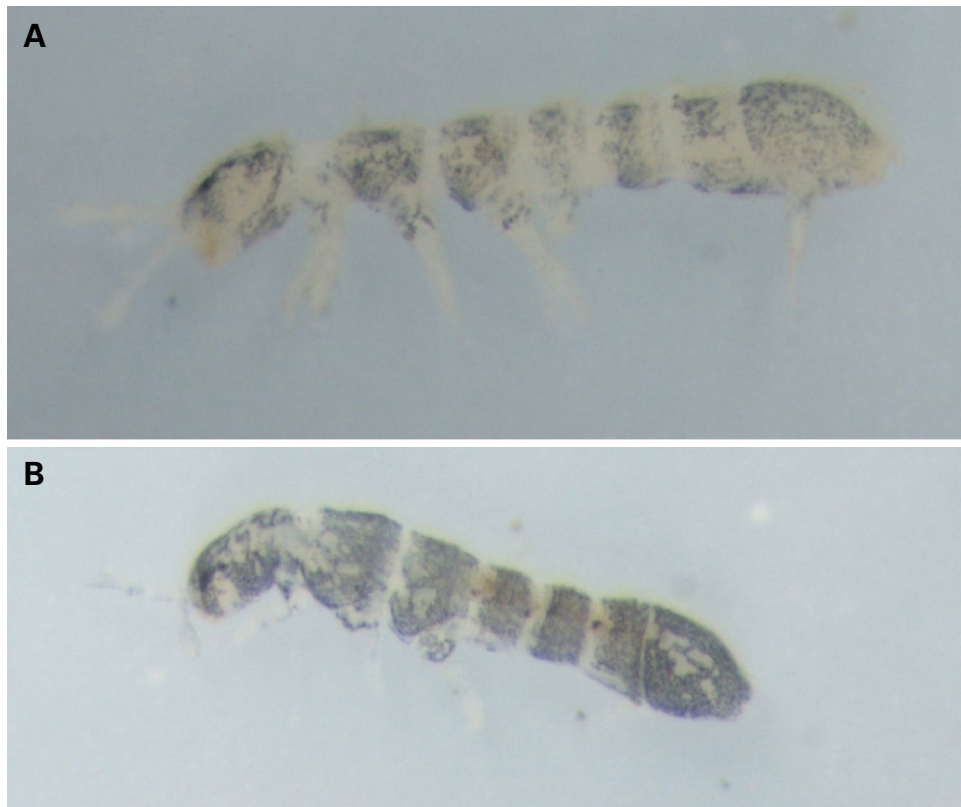
Fig. 1. Habitus of Folsomia quadrioculata (A) and Folsomia octoculata (B).

Ground color pale yellow overlaid with mottled grayish pigment except intersegmental margins; antennae pale; legs grayish on coxae, otherwise pale; furcula pale yellow. Eye patches black, ocelli 2 + 2, arranged far from each other on each side. PAO narrow, elongated, 1.2 times longer than width of Ant I. Antenna about 1.5 times of head diagonal. Ant I with 3 small basal microsensilla (2 dorsal and 1 ventral, bms) and 2 ventroapical sensilla (Fig. 2A, B); Ant II with 3 bms (1 dorsal, 1 ventral, and 1 latero-distal) (Fig. 2C, D), lateroapical setaceous sensillum present; Ant III with 1 bms and 5 sensilla (Fig. 2E), the setaceous sensillum absent; Ant IV without apical bulb, with subapical knob in a pit and 6 slender, curved differentiated setae (Fig. 2F). Maxillary palp bifurcate, outer maxillary lobe with 4 sublobal hairs. Labrum 4/5, 5, 4. Cl without teeth. Tibiotarsi III with many setae (up to 28) (Fig. 2G). Sensillary chaetotaxy of Th. II to Abd. IV–VI as 4, 3 / 2, 2, 2, 8, including 1, 0 / 1, 0, 0, 0 microsensilla (Fig. 2H). VT with 3 + 3 latero-distal setae. Ret quadridentate and 1 seta. Man with 1 + 1 ventroapical setae. Dens normally with 8 anterior and 3 posterior setae. Mucro bidentate.