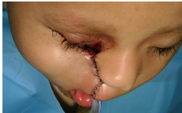
Fig. 6. Remnant medial lower eyelid defect forming the oroocular fistula after surgery. It needs to be repaired during a secondary surgery.

the anterior nasal spine and the base of pyriform aperture followed by subcutaneous dissection of the nasal dorsum and philtrum. After interchanging the L and M flap, the turn-over flap from the lower eyelid was added superiorly to complete the inner lining of the lower eyelid and cheek (Fig. 4). The freed orbicularis oris muscle was repaired with full width from the columellar base to the red vermilion. Finally, the oral lining of the