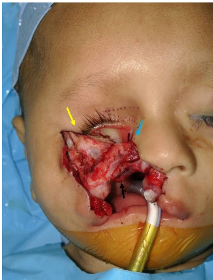
Fig. 4. Intraoperative photograph after complete reconstruction of the inner lining by interchanging the lateral and medial mucosal flaps and transposition of the turn-over flap from the lower eyelid (yellow arrow, the turn-over flap for lateral lower eyelid reconstruction; blue arrow, lateral mucosal flap for superior inner lining of the cheek; black arrow, medial mucosal flap for inferior inner lining of the cheek).