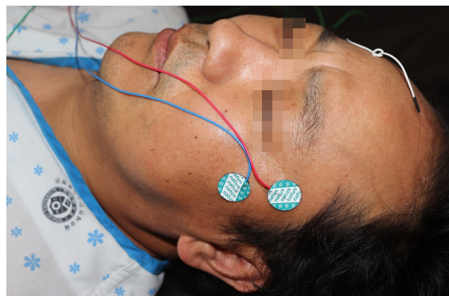
Fig. 3. Patient under trigeminal somatosensory evoked potential test. Electrodes connected to red and blue wires were surface nodes for stimulation. A needle electrode 12 mm in length was positioned on the forehead and used for recording.