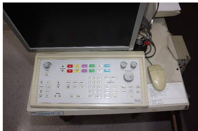
Fig. 2. Trigeminal somatosensory evoked potential measuring machine (Medtronic Inc., Minneapolis, MN, USA).

The patients were examined with TSEP on both sides of the face, using the non-traumatized side as control. TSEP was measured with Key Point (Medtronic Inc., Minneapolis, MN, USA) while the patients were comfortable and relaxed (Fig. 2). Surface electrode used for stimulation was positioned at the affected area of ION damage. A 12-mm needle electrode was placed at the forehead and used for recording (Fig. 3). In this test, 200 times of 3.1 Hz bipolar transcutaneous electrical stimulations were applied to develop an average wave form. Three times the sensory threshold was chosen in order to eliminate background brain and muscle noises. The standard tri-phase wave form was observed in all tests. N1 represented well as the start point of the evoked potential and P1 also did its role quite well by indi-