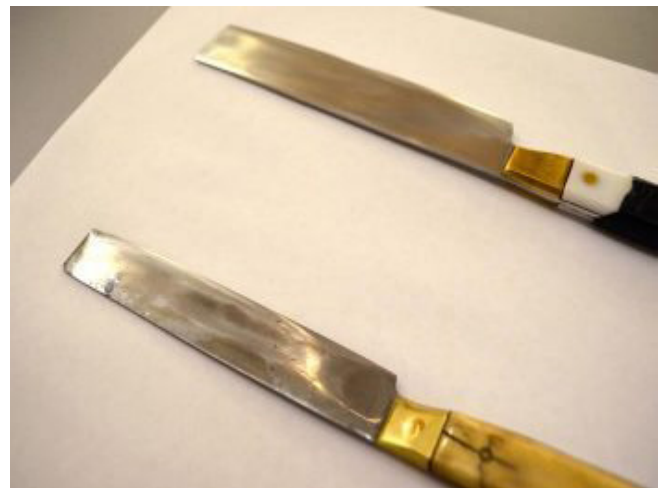
Fig. 2. Chicken chalefs for kosher slaughter. Adapted from Gross GA [31].

Similar to halal slaughter techniques, shechita is carried out without stunning. The esophagus, trachea, jugular veins and the carotid arteries of the animal are cut and its blood is allowed to flow out—again because blood contains impurities that render meat unsuitable for human consumption. Additionally, beheading is not permissible. According to Jewish law, the slaughter should be specifically done by a skilled ritual slaughter man (shochet) with a particular knife (chalef) which is very sharp with a straight blade (Fig. 2) that is no less than double the width of the neck of the animal to be slaughtered. The regulations for slaughter are very rigorous. The slaughter must done according to Jewish law following the highest criterion of current animal handling applications. Before the slaughter, the shochet both asks a blessing asking for