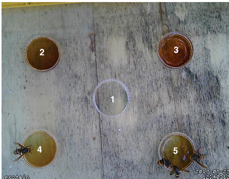
Fig. 2. Field trials for the attraction of Vespa velutina workers using Bacillus sp. BV-1 cultures. 1. Blank, 2. 30% (v/v) sugar medium, 3. 50% (v/v) sugar medium, 4. Cultures grown on 30% (v/v) sugar medium, 5. Cultures grown on 50% (v/v) sugar medium.