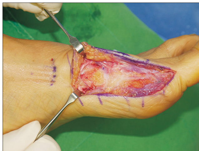
Figure 3. The bunion is removed and a bone graft is prepared using resected bunion, and is placed in the gap of the osteotomy site.