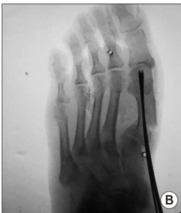
Figure 2. (A) Intraoperative photograph shows the distal fragment was medially translated. (B) Fluoroscopic image shows medial displacement and lateral angulation of the distal fragment.