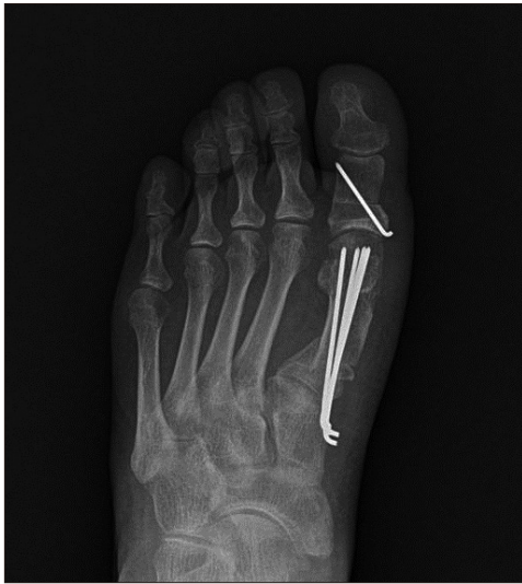
Figure 4. Postoperative radiograph shows satisfactory reduction of hallux valgus deformity.

the metatarsal head. The correction was then checked using C-arm fluoroscopy (Fig. 2). The Kirschner wires were buried under skin and a bone graft was prepared using resected bone, and was placed in the gap of the osteotomy site (Fig. 3). The medial joint capsule was repaired using absorbable sutures, and correction was rechecked using C-arm fluoroscopy after wound closure (Fig. 4).