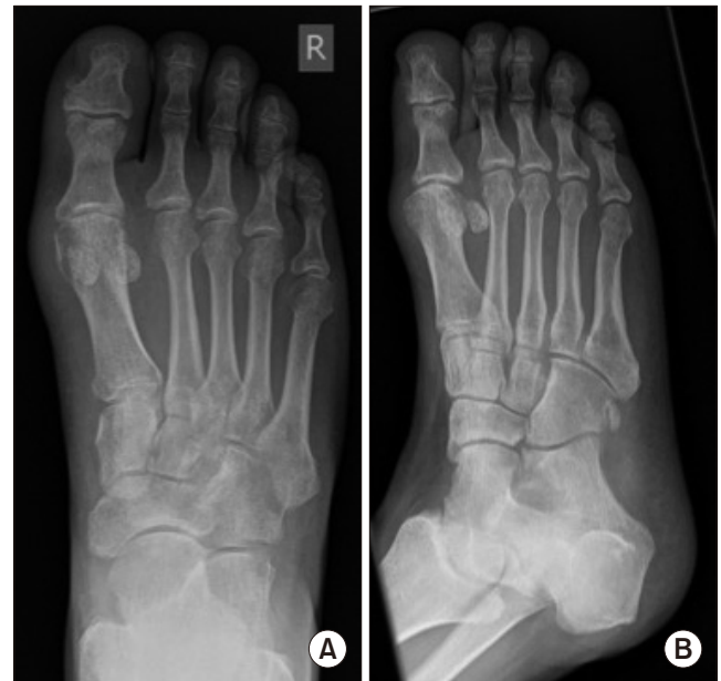
Figure 1. Anteroposterior (A) and oblique (B) plain radiographs at the time of presentation.

The histology of the samples revealed a non-specific inflammatory arthropathy, with no signs of gout and the soft tissue samples grown S. mitis sensitive to penicillin and clarithromycin. The microscopy of the synovial fluid did not reveal any crystals. After discussing with our microbiologist colleagues a course of six weeks of oral clindamycin 450 mg every 6 hours was started. The patient was given a short walker boot for mobilising.