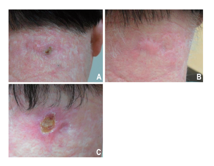
Fig. 2. A 60-year-old man with a 2-cm squamous cell carcinoma of the posterior neck before (A), 3 months (B), and 32.5 months (C) after 50-Gy radiation therapy in 20 fractions.

The incidences of acute and late toxicity with radiotherapy are shown in Table 2. No grade 3 or higher toxicities were evident. The most common late adverse events were mild hyperpigmentation (5.3%) and dry skin (10.5%).