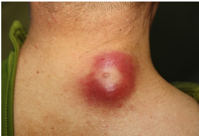
Fig. 2. Infected epidermal cyst.