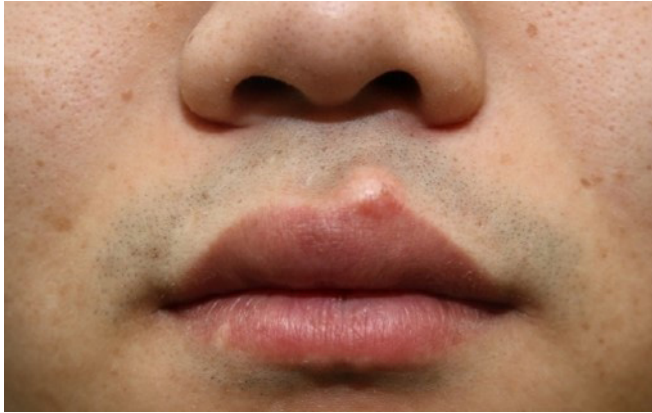
Fig. 1. Epidermal cyst on upper lip.