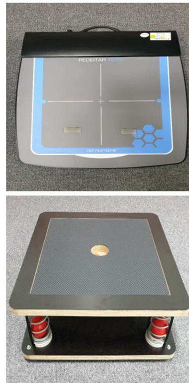
Fig 2. The Biorescue (RM Ingenierie, France), a instrument for measure balance ability. Biorescue is designed to measure the movement of the body's center of pressure (COP) at a point where the gravity influences the center of gravity (COG) of the body or object in order to assess the migration area (mm 2 ) while the movement is taking place.

The data collected for this study was analyzed using SPSS 18.0 for Windows. Also, repeated one-way ANOVA was