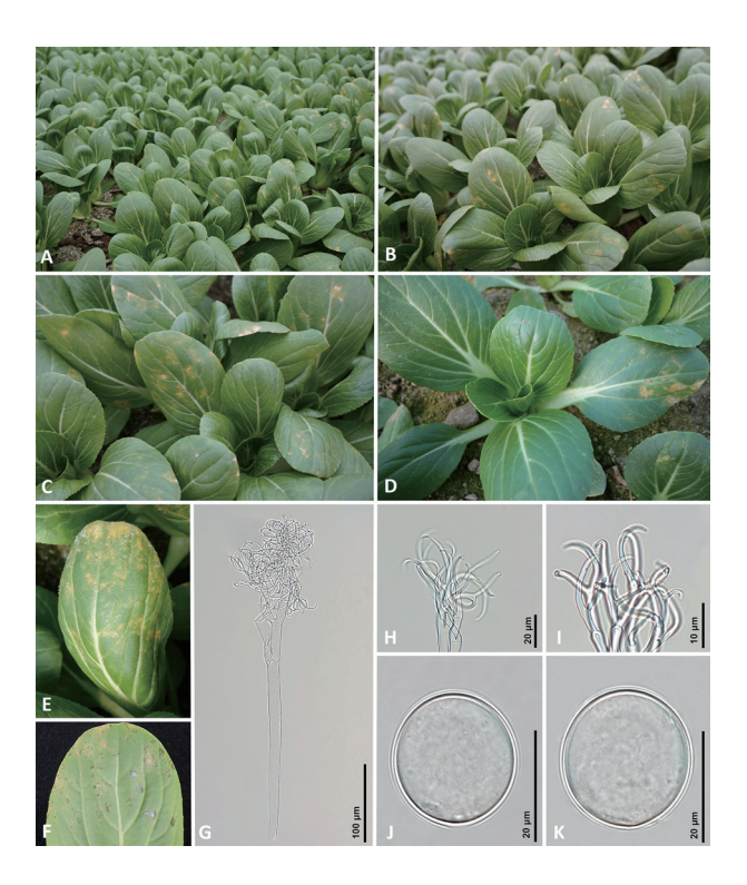
Fig. 1. Downy mildew disease caused by Hyaloperonospora brassicae on pak choi ( Brassica rapa subsp. chinensis ). (A, B) Downy mildew occurrence in a plastic farm. (C, D) Initial symptom with yellowish leaf spots. (E) Vein-limited spots on the upper leaf surface. (F) Whitish oomycete matrix on the lower surface. (G) Conidiophore. (H, I) Ultimate branchlets. (J, K) Conidia.

mate branchlets (n=50) were mostly in pairs, curved sigmoid, 10~30 µm long, and displayed obtuse subtruncate tips (Fig. 1H-I). Conidia (n = 100) were broadly subglobose, whitish, and measured 21.0~28.5 × 20.0~25.5 µm (av. 25.2 × 22.86 µm) with a ratio of length to width of 1.01~1.21 (av. 1.10) (Fig. 1J-K). All morphological characteristics closely matched those of H. brassicae known on Brassica species (Choi et al., 2012; Gäumann, 1923; Hong et al., 2008).