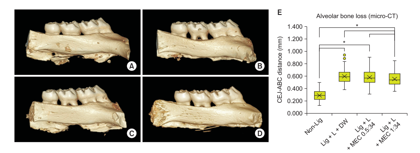
Fig. 3. 3-Dimensional micro-computed tomography (micro-CT) image of alveolar bone loss around the maxillary second molar. Non-Lig group (A), Lig + L + DW group (B), Lig + L + MEC 0.5:34 group (C), Lig + L + MEC 1:34 group (D), and distance between cemento-enamel junction (CEJ) and alveolar bone crest (ABC) (E).

Lig, ligation; L, lipopolysaccharide extracted from P. gingivalis KCOM 2804; DW, distilled water; MEC, mangosteen extract complex. * p < 0.05; Mann–Whitney U test .