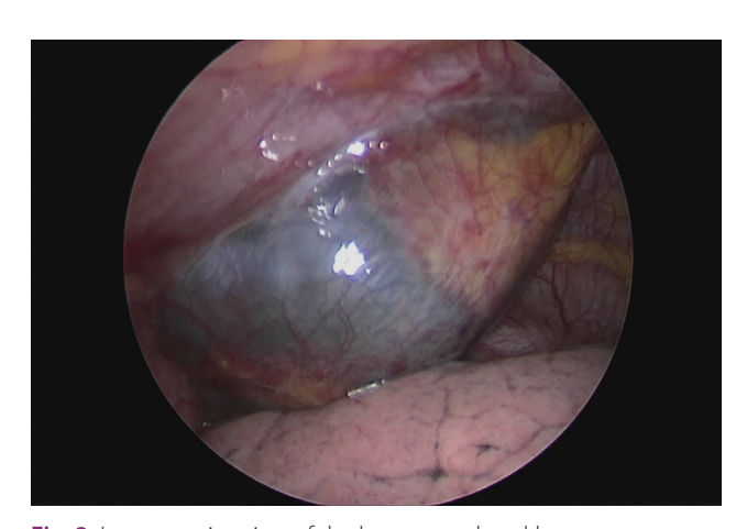
Fig. 3. Intraoperative view of the large extrapleural hematoma as seen in a video captured image.

The procedure was done with two ports, with 5 mm camera port in her 9th intercostal space in her mid-axillary line and a 5 mm port anteriorly. There were no adhesions and a large hematoma sac was seen at about 10×8 cm in dimensions with dark blood discoloration (Fig. 3). The sac was opened with Harmonic scalpel at the base and at its entire longitudinal length. The procedure