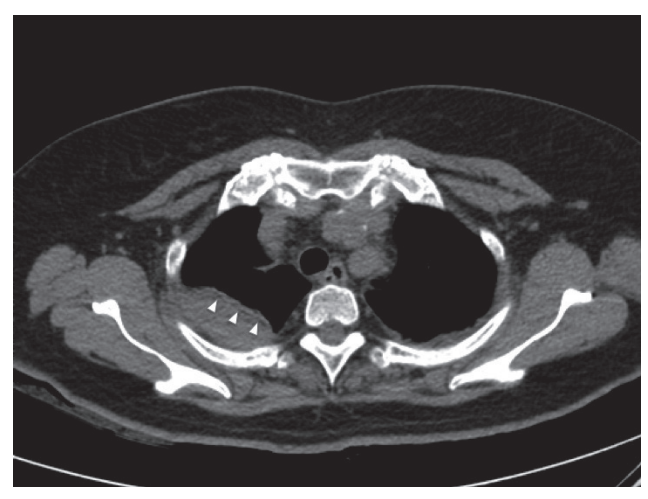
Fig. 2. Computer tomogram of the patient's chest showing large amount of right extrapleural hematoma presenting the "stripe" sign (arrowheads) taken 4 days later.

were 12.8 g/dL, but dropped to 9.5 g/dL the day after. Two pints of blood were given. Pig-tail drainage was done on the 4th hospital day without resolution and a follow up chest computer tomogram was taken. The images presented remaining local hematoma (Fig. 2). Thus, a video assisted thoracoscopic procedure was scheduled on the 11th hospital day with supposed diagnosis of loculated effusion or impending empyema. The procedure was done to allow re-expansion of her lung.