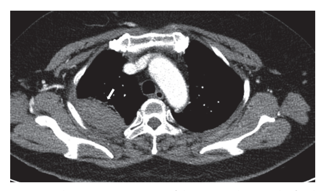
Fig. 1. Initial computer tomogram of the patient showing the focal hematoma (arrow).

A 63 year-old female patient had visited our emergency center at Halla Hospital after fall down injury from an apartment veranda on the second floor with symptoms of chest wall pain, back pain and lower extremity pain. She was found with multiple rib cartilage fractures from her right 3rd to 5th ribs, sternum fracture and moderate amount of right hemothorax, L2 unstable burst fracture, L1 compression fracture, left transverse process fractures of L1, L2, and L4, superior rami fracture of her left hip, and right calcaneus fracture. Her initial computer tomogram presented the focal hematoma (Fig. 1). Her initial hemoglobin levels