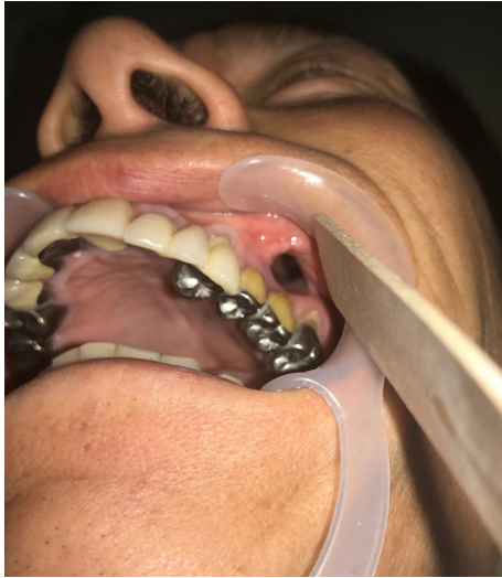
Fig. 1. An oroantral fistula was observed with dirty granulation tissue.