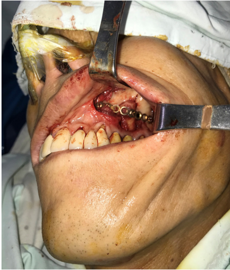
Fig. 5. The harvested bone was inserted into the defect.