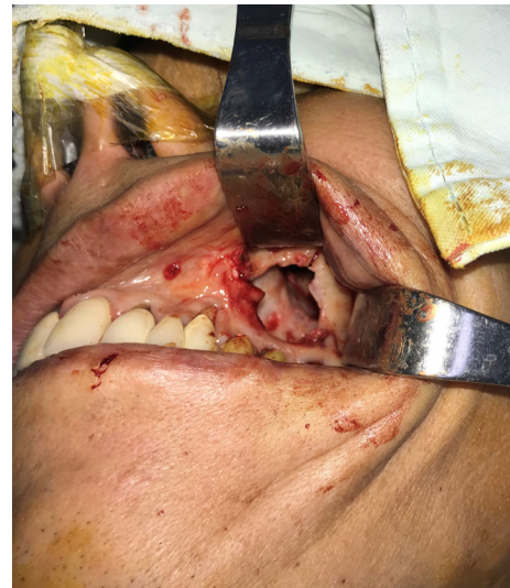
Fig. 4. The bony defect was revealed after removal of dirty granulation tissue surrounding the fistula.

lar incision was made around the OAF with a 2-mm margin, and the epithelial tract and any inflammatory tissue (i.e., granulation tissue) within the opening were completely excised. During the removal of the granulation tissue, we found rice in the maxillary sinus. The size of the bony defect was 2.0×2.0 cm (Fig. 4). A piece of corticocancellous bone from the iliac crest was harvested, inserted into the bony defect, and fixed with a straight 12-hole miniplate (Synthes, Paoli, PA, USA) and screws (6 mm; Synthes) (Fig. 5). The soft tissue defect was covered with an elevated transposition flap (Fig. 6). A trapezoidal buccal mucoperiosteal flap was reflected from the alveolar process and lateral wall of the maxilla, and released to the gingivolabial sulcus.