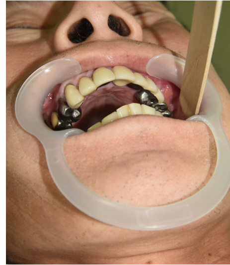
Fig. 7. At a 1-year follow-up, the oroantral fistula had completely healed and no other complications were observed.

OAC is a complication that can occur after extraction of the upper posterior maxillary teeth accompanied by osteotomy [4].