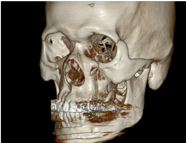
Fig. 2. The patient had normal alveolar bone at the time of the zygomaticomaxillary fracture.

Postoperatively, the oral suture site dehisced, exposing the absorbable plate. The patient did not seek treatment for the disrupted wound despite several episodes of sinusitis and inflammation of the oral cavity. After 5 years, an OAF opened and became filled with dirty granulation tissue. Food items such as rice frequently entered the gingival cavity, causing the patient to experience discomfort, which led him to visit our clinic. For diagnosis, three-dimensional computed tomography scans and radiographic images were obtained. Radiological findings showed a 2.0×2.0 cm bony defect on the alveolar bone along with the OAF (Fig. 3). Excision of the OAF and coverage of the bony defect were indicated.