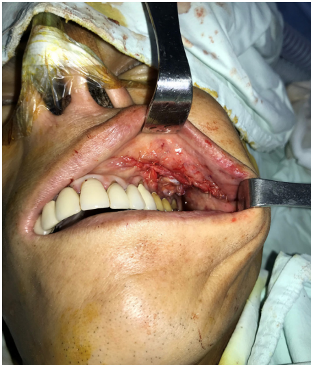
Fig. 6. The soft tissue defect was covered with a buccal transposition flap.