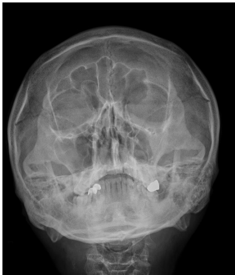
Fig. 4. Postoperative 1-month radiographic image.

been reported that a wooden foreign body is not detected in CT scan. In that case, the foreign body was demonstrated as a radiolucent area like air [1]. Fortunately, CT images were useful to detect wooden foreign body in our case. However, we should notice radiolucent characteristic of organic foreign body and possibility of misdetection. When nonmetallic foreign body injury is suspected, we need to manipulate CT scan's slice interval or image demonstration setting.