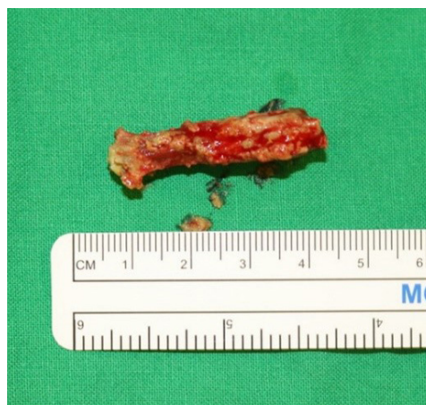
Fig. 3. Wooden stick foreign body with dirty necrotic tissue.

The maxillary sinus is surrounded by a bony wall. It is a closed