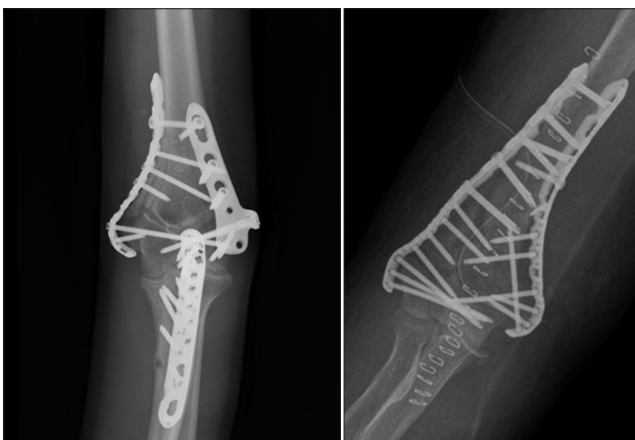
Fig. 3. Perpendicular plating and parallel plating for fixation of distal humerus fracture.