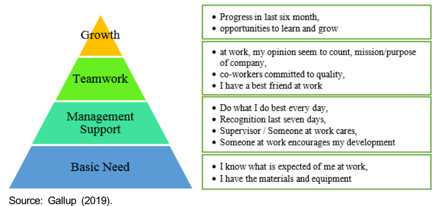
Figure 1: Gallup Modification Hierarchy