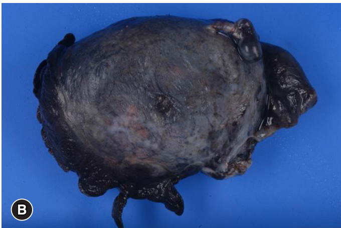
Fig. 2. (A) Intraoperative findings: a right ischemic fallopian tubal mass (T) and a grossly normal ovary (O) are beside uterus (U). The torsion of the right fallopian tube (arrow) was observed at midportion. (B) Operative specimen: a 6x4 cm sized, ovoid shaped, purple-brown colored, diffusely congested fallopian tube.

presentation, laboratory findings, and imaging features makes it difficult to identify an isolated tubal torsion preoperatively and subsequently delays prompt surgical intervention to prevent irreversible vascular changes in the fallopian tube [12].