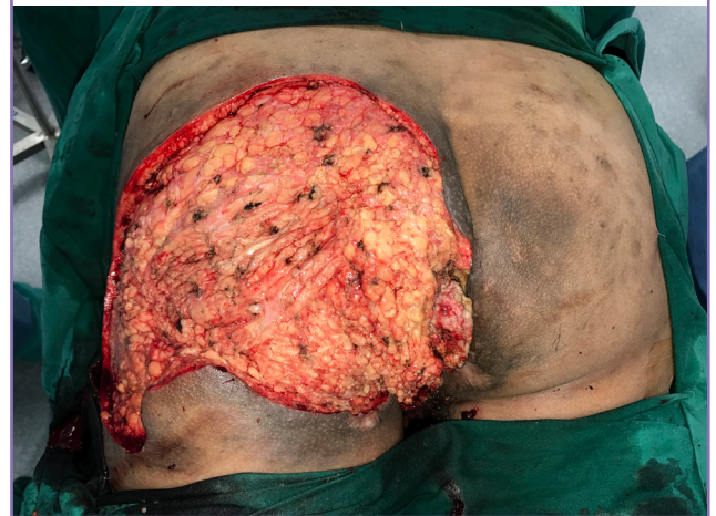
Fig. 1. Suprapubic, inguinal and left gluteal regions (preoperative)

Figure shows the left gluteal region after excision of the left gluteal lesion (intraoperative view).