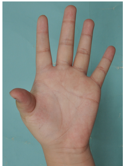
Fig. 2. Preoperative photograph. Radial deviation, unstable metacarpophalangeal abduction, first web space narrowing, and scar contracture were found after polydactyly reconstruction. The patient showed limited abduction and extension of the metacarpophalangeal joint of the left thumb.

The reoperation rates for deformity correction after corrective surgery for polydactyly have been reported to be between 12% and 26% [1,2]. In our literature review, no reports were found of a simultaneous secondary revision operation and fracture fixation in a polydactyly patient after trauma. We report the treatment of a 13-year-old boy via simultaneous secondary corrective osteotomy, first web space release, scar release, and fracture fixation, with an acceptable result.