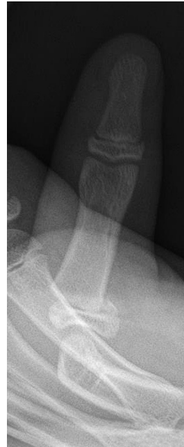
Fig. 1. Preoperative X-ray view. A simple anteroposterior X-ray of the thumb revealed a fracture in the proximal metacarpal bone (Salter-Harris type II). In addition, subluxation of the metacarpophalangeal joint of the left thumb was observed.