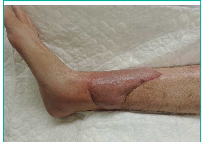
Fig. 3. Aesthetic outcomes at a 1-year follow-up

The reported relapse rate of the psychiatric disorders was 23.1%, but the flap-related complication and re-intervention rates were not stated. The main issue during hospitalization was poor compliance with postoperative immobilization. However, all flaps healed uneventfully. Psychiatric patients, and those with learning disabilities, often present with an altered perception of pain combined with a reduced ability to communicate symptoms [3]. Moreover, studies have raised awareness about interactions between antipsychotic, anesthetic, and analgesic medications due to enzymatic induction. In our case, even though the heavy daily antipsychotic treatment received by the patient (topiramate, olanzapine, and lorazepam) was never interrupted during the hospital stay, pharmacologic interactions between analgesic (oxycodone) and antipsychotic drugs may have decreased the effectiveness of both analgesics and neuroleptics. This phenomenon probably triggered pain or discomfort, along with psychiatric collapse, leading the patient to avulse his free