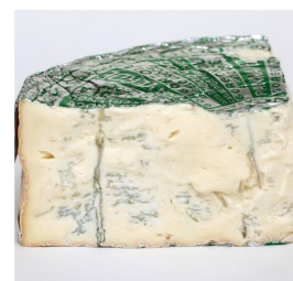
Fig. 2. Blue Vein Cheeses