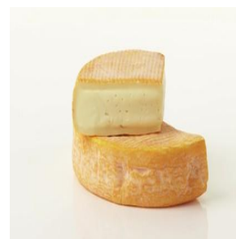
Fig. 1. Smear-Ripened Cheeses

The sensory attributes are critical and crucial aspect to be the widespread flavorful and food acceptance of consumer. Due to the integral nature of sensory perception with dairy foods, a sensory measurement is often the final step in many experiments or applications[1]. Therefore, the sensory attributes of smear-ripened and blue-vein cheeses are important information to determine the quality of cheese.