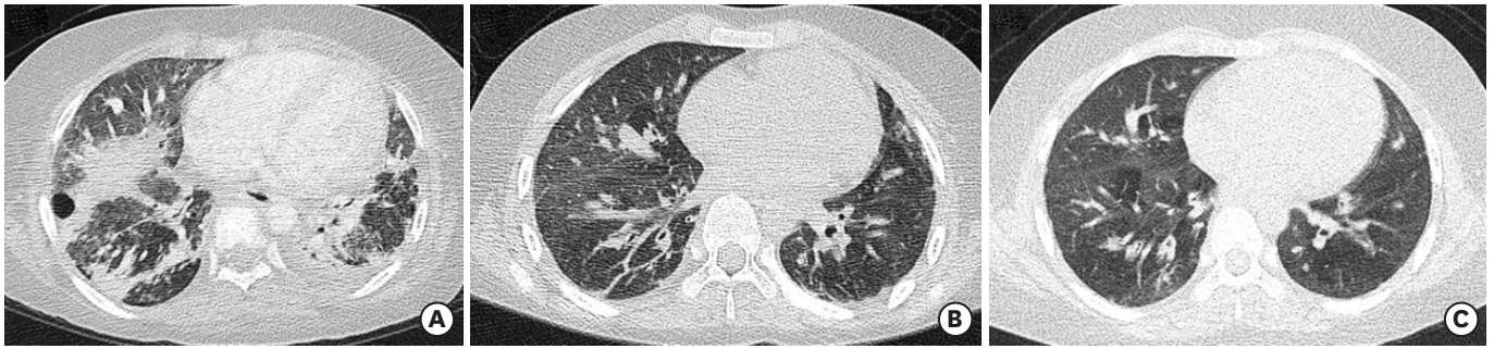
Fig. 3. Chest computed tomographic changes (A) Atelectasis in the posterior segment of both upper lobe; superior, posterior, and lateral basal segments of right lower lobe and right middle lobe; lingular division of left upper lobe; and superior and anteromedial basal segment of left lower lobe. Multifocal intrathoracic loculated air (HD#37). (B) Diffuse mosaic attenuation in both lungs, diffuse bronchial wall thickening in right upper lobe and both lower lobe (HD#111). (C) Multifocal subsegmental/linear atelectasis in both lungs, diffuse bronchial wall thickening in left lower lobe (326 days after discharge). Abbreviation: HD, hospital day.

obliterans has been reported in up to 21% of cases. 23) In the present case report, the patient showed signs of bronchiolitis obliterans on computed tomography ( Fig. 3. B and C ). In addition, difficulties with weaning were noted due to the lack of cooperation from the patient, who was autistic, and the patient was admitted to the intensive care unit and had to undergo ventilator therapy for a long-time period, which may have led to more lung damage.