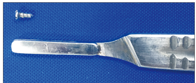
Fig. 1. Machined surfaced titanium implant installed in rat tibias. Serkan Dundar et al: An experimental investigation of the effects of chronic stress on bone-to-implant contact. J Korean Assoc Oral Maxillofac Surg 2019

Restraint stress was applied to the rats in the RS group using special devices. Rats were placed in polyvinylchloride tubing according to their size, and holes were drilled in the tubes at the level of the rats' noses to allow them to breathe. This restraint procedure was performed for 3 hours per day throughout the experimental period 14,15 .